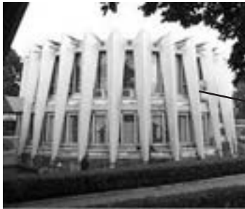
Tridents and pillars