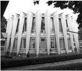
Tridents and pillars